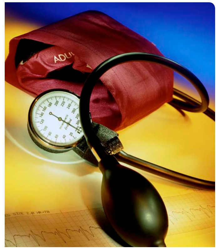
Managing your blood pressure is a great way to reduce your risk of stroke.