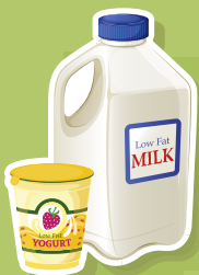
Low-Fat & Non-Fat DAIRY