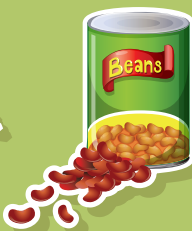
Beans & Legumes