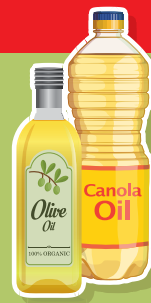
NONTROPICAL VEGETABLE OILS