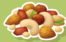
NUTS & SEEDS